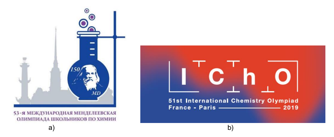
Fig. 1. a) The logo for the 53<sup>rd</sup> International Mendeleev Olympiad illustrating the 150<sup>th</sup> anniversary of Mendeleev Periodic Table; b) The logo for the 51<sup>st</sup> International Chemistry Olympiad inspired by the Mendeleev Table.

The IMO was all about the 150<sup>th</sup> anniversary. Even the logo was designed accordingly, as shown on Fig. 1a. However, not only the IMO logo was inspired by this anniversary. The Periodic Table was an inspiration to the "graphic design students" from France to design the logo for the 53<sup>rd</sup> IChO (Fig. 1b.). Unaware of the IYPT the designers have stated: "The letters of the framed acronym remind us of the Periodic Table of Mendeleev, one of the fundamental pillars of chemistry" [4]. Taking this into consideration, the impact that the periodic table has on all of us both chemists or non-chemists, is more than obvious.