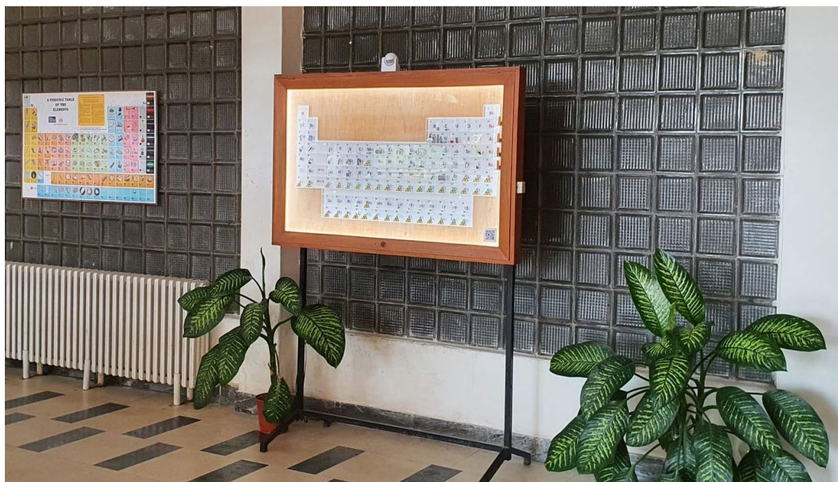
Fig. 1. The elemental samples display with the picture of the periodic table published by the Royal Society of Chemistry and Time-Life

Initially, we planned to place each element in a 10 ml vial, but after displaying the first samples, we decided to simply place the samples of stable elements in the cells. The idea actually came from a wall chart of the elements with such pictures in our main amphitheater, which was published by the Royal Society of Chemistry and Time-Life in 1987. We decided to move this wall chart next to our display for comparison but also to complement the lack of the radioactive elements. We feel that they do make a great combination (Fig. 1).