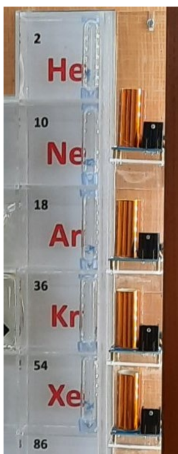
Fig. 4. A picture of the noble gases with the Tesla coils

It may sound simple, but many problems with limited funds had to be solved in order to make such an attractive and educational display. We are proud that we have had more than 80 years of experience between the two of us in many areas of chemistry, including with various experimental methods. So after all, we can proudly say: Elementary, my dear Watson!