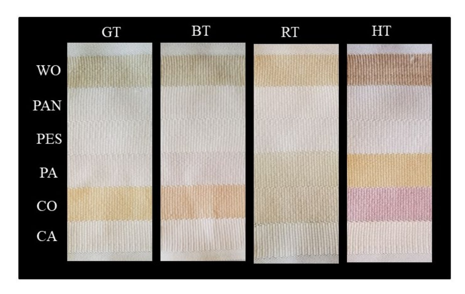
Fig 3. The appearance of the dyed multifiber fabric using different tea aqueous extracts

reflection at a certain wavenumber comes from the fabric itself and both colored and non-colored extract compounds competing for a position on its surface. This is the reason behind the inconsistencies between the K/S values of fabrics functionalized with GT and RT and their appearances. From the reflection spectra of fabrics functionalized with RT (Supplementary material, Fig. S2b), it seems that in the case of PA, a higher amount of noncolored bioactive compounds absorbing at 283 nm (Supplementary material, Fig. S1) was bound to the fabric surface, contributing to a lower reflection and higher K/S value than WO.